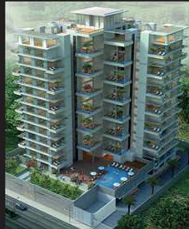
AJMERA ARIA, Pune

After its booming growth in real estate, the reach and interests of Ajmera Group have expanded to other diverse and equally successful ventures such as steel, printing and social welfare.