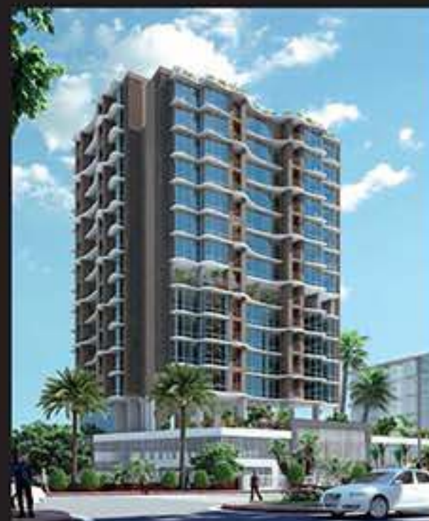
AJMERA REGALIA, Mumbai