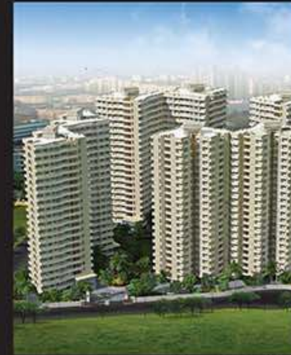
YOGI DHAM, Kalyan