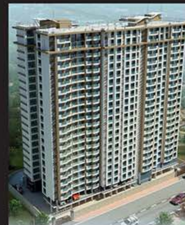
AJMERA PRISTINE, Mumbai