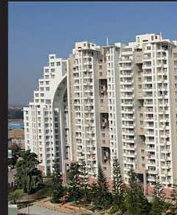
AJMERA INFINITY, Bangalore