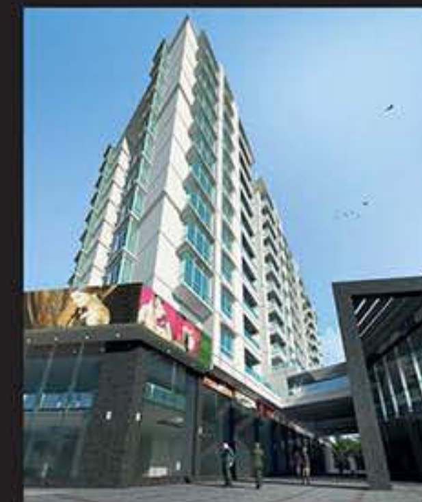
AJMERA AVENUE, Bangalore